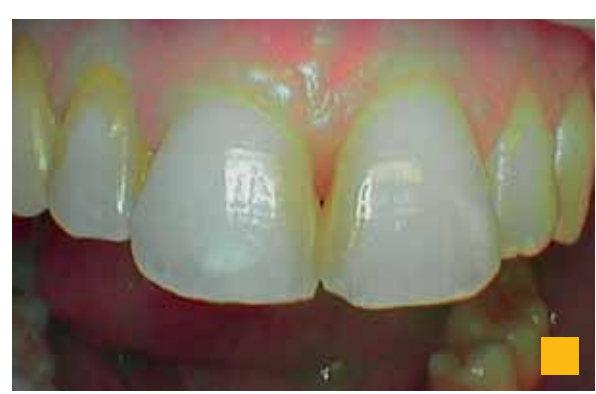
SOPROCARE in Perio mode*