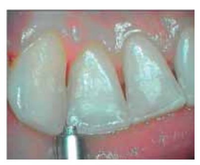
SOPROCARE in Daylight mode: after AIR-N-GO*