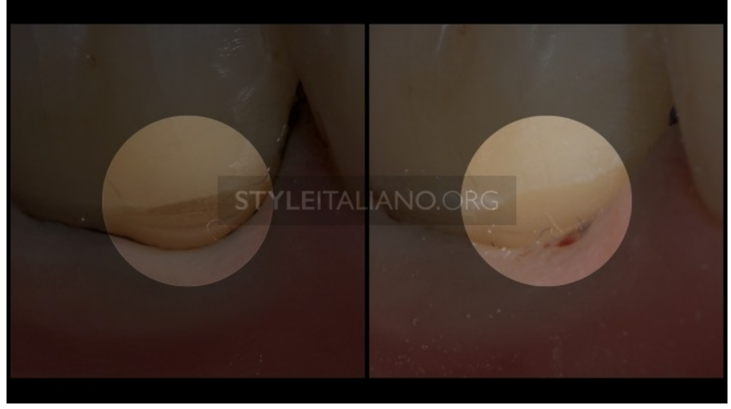
lmg. 5 - Before & after.