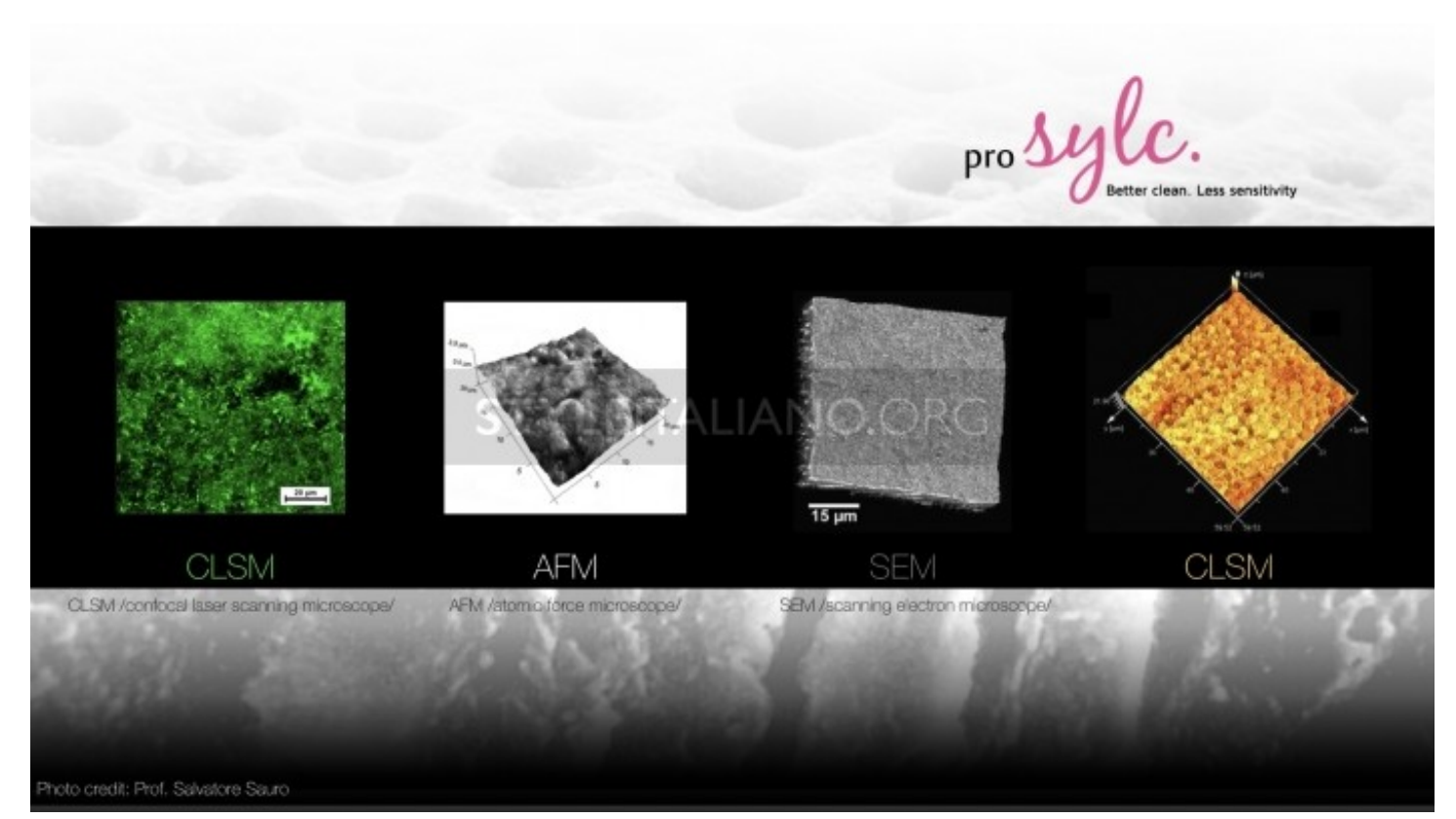
Img. 8 - Treated dentinal surfaces; different microscopic images (courtesy of Prof. Salvatore Sauro) of bioactive smear layer.

Img. 7 - Air-polishing procedure: before - after.