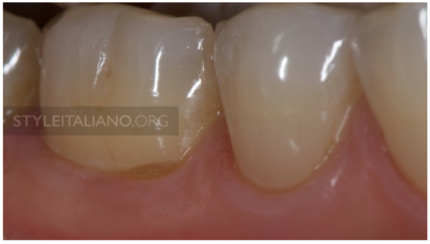
Img. 3 - Initial situation - dentine exposition.