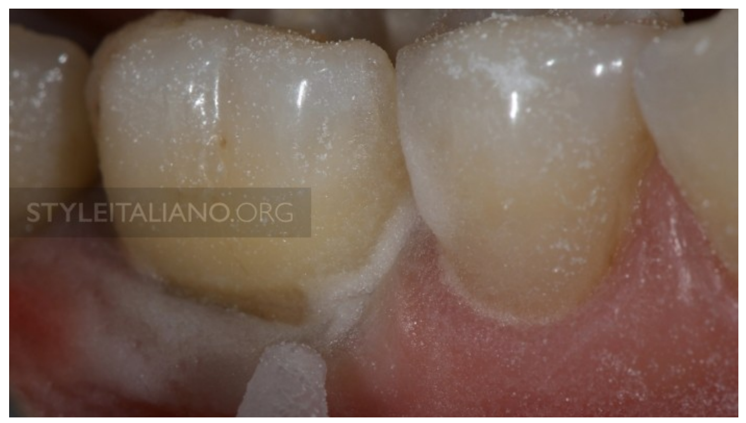
Img. 4 - Surface treatment.