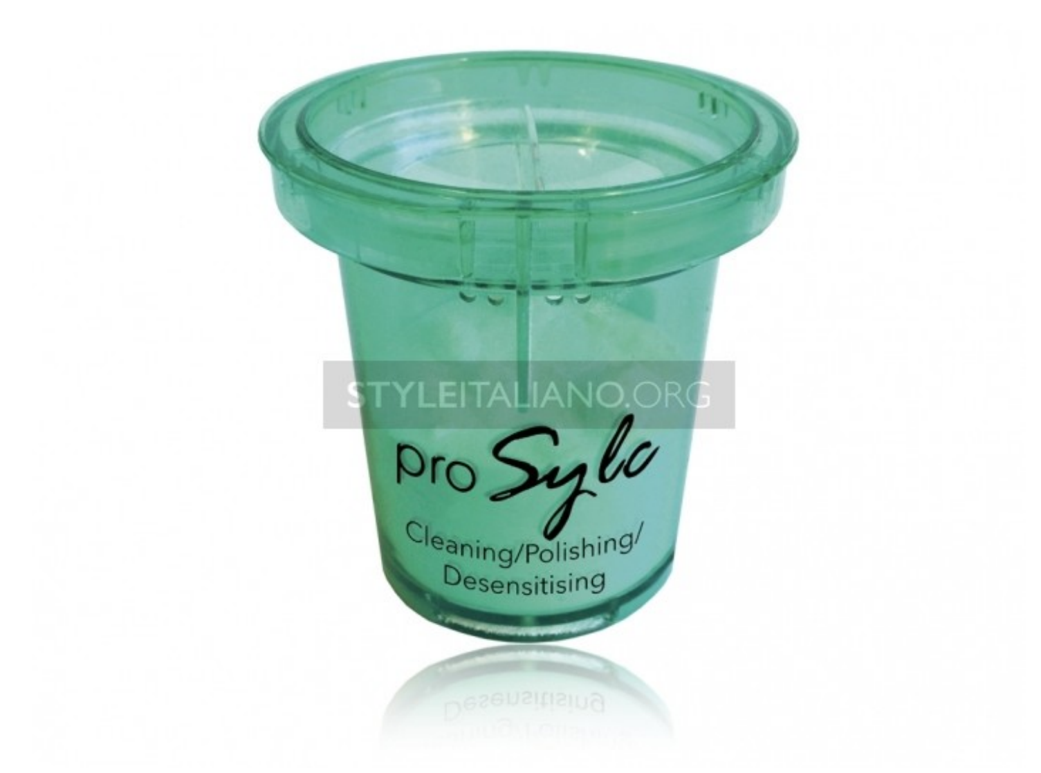
Img. 6 - The "smart powder".