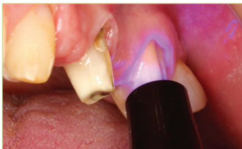
Air dry to remove solvent and light-cure for 10 seconds.