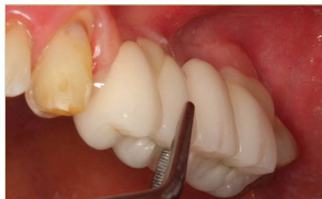
Fill internal surface of the restoration with DUO-LINK UNIVERSAL™ resin cement and immediately seat restoration.