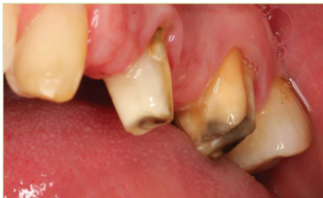
Prepared multiple-unit bridge.