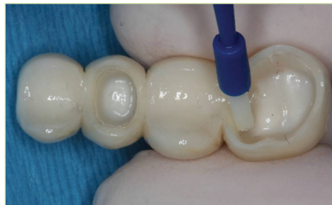
After cleaning internal surface with ZirClean™, apply a thin layer of Z-PRIME Plus to the zirconia bridge. Air dry for 3 to 5 seconds.