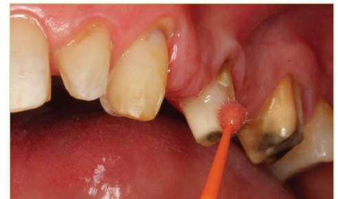
Apply two separate coats of ALL-BOND UNIVERSAL®, scrubbing the preparation with a microbrush for 10-15 seconds per coat. Do not light cure between coats.