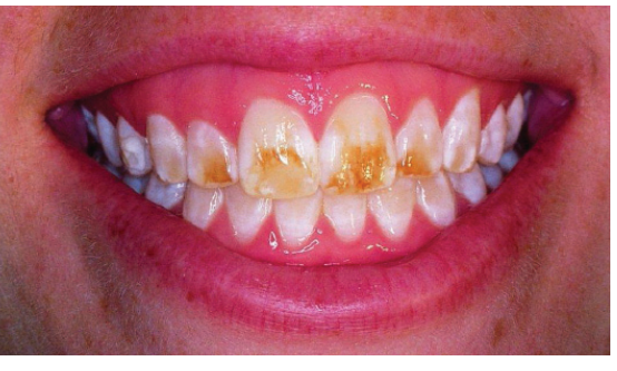
Figure 3: Discoloured teeth prior to treatment with Opalustre

In using Opalustre, it will only minimally alter the enamel surface contours, permitting a conservative rather than restorative approach. This can then help to avoid the need to apply aesthetic composites, and for those practitioners who offer bleaching and whitening treatments, it can be used to