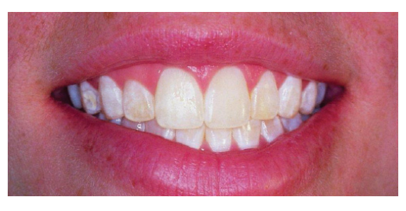
Figure 6: After treating with Opalustre

syringe and a 1.00mm layer of material applied to the labial surfaces. A 1: 10 reducing handpiece can then be used at a slow RPM rate, with the Opal prophy cups directly on the enamel surfaces for up to 60 seconds. Following this, the teeth can then be rinsed and evaluated, and the procedure repeated if necessary. Tooth Whitening procedures can then be used to further enhance a lightening effect.