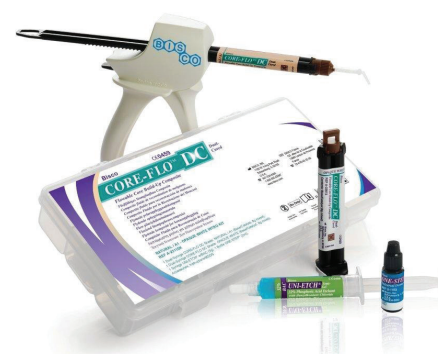
Figure 6: Core - Flo DC Intro Kit