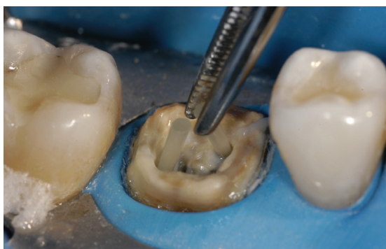
Figure 3: Insertion of light post into prepared canal