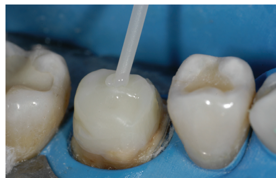
Figure 4: Bisco Core - Flo DC is easily and quickly manipulated to create a core form