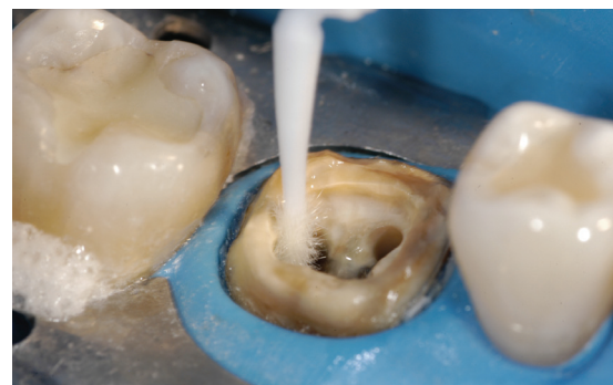
Figure 2: Application of Select HV or Uni-etch to the canal followed by application of one step universal dental adhesive