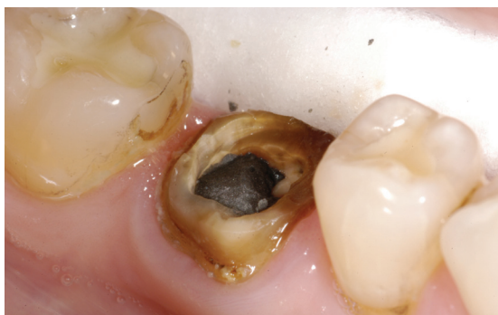
Figure 1: Typical restoration requiring post and core treatment

Several independent evaluations of Core - Flo DC have been undertaken with Dental Advisor * reporting that 675 of