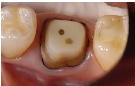
Figure 5: Dentine-like' strength allows immediate preparation. One step compatibility guarantees a long lasting bond