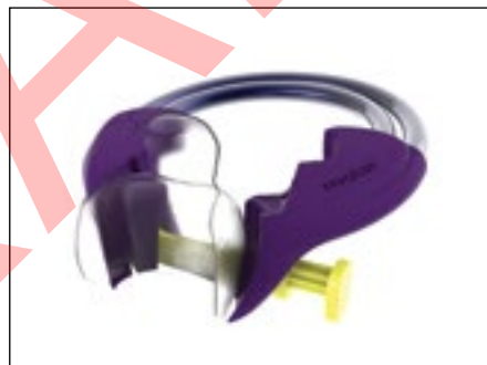
Figure 2. The Biofit HD matrix is shown with the Molar Twin Ring separator and a Large Diamond Wedge.