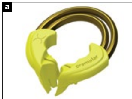
Figure 5. Yellow (bicuspid) and purple (molar) Twin Ring separators show the advanced design that allows better adaptation to the teeth, and advanced spring design that will resist spring fatigue.