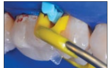
Figure 14. Buccal view of the Bicuspid Twin Ring (yellow) straddling the Extra-Large Diamond wedge (blue). When possible, the operator can leverage the technique of progressive wedging. Progressive wedging is the use of progressively larger wedges moving from the pre-wedging stage to final wedging.