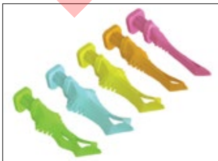
Figure 4. Oblique view of the Diamond Wedges shows the low profile needed to allow broad contacts. Note that as the wedges get larger, they do not get taller. This allows the aggressive emergence profile of the Biofit Matrix to be maintained.