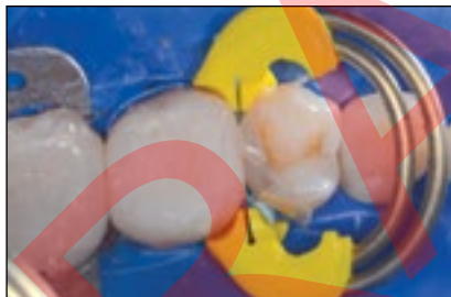
Figure 12. When the first molar, then the second molar have been filled, the bicuspid can be injection molded once the other matrices on the other teeth have been removed and the final Twin Ring separator removed and replaced. There is usually no need to remove the wedge when one of the back-to-back restorations is finished and corresponding matrices removed. This saves valuable time, also eliminating bleeding problems.