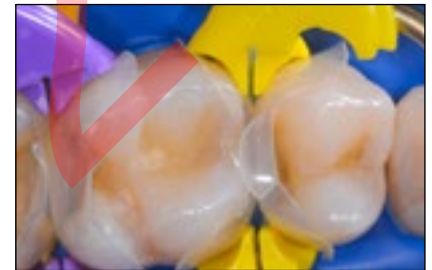
Figure 11. High-magnification image of the extensive occlusal embrasure containment of the Biofit HD matrices. This important advancement in matrix technology creates better injection pressure, less need for hand manipulation of the composite, and a drastic reduction of dangerous and time-consuming occlusal embrasure grinding.