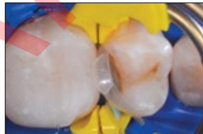
Figure 13. High-magnification of Figure 12 demonstrates a modern cavity preparation with infinity edge margins. Note that the separator can be placed on the distal side of the wedge instead the normal straddling position. Either is acceptable with the flexibility of the Diamond Wedges.