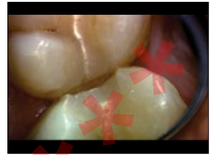
Figure 8. Preoperative view shot through the lens of a Global microscope of the chipped marginal ridge in Figure 7 radiograph, an all too common sight with traditional Class II composites.