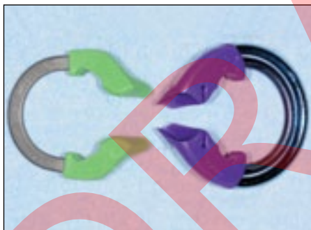
Figure 1. Comparison of the Trident separator (left side, green) and the Bioclear Twin Ring (right side, purple) 25 times to 16 mm opening. The green separator has lost nearly half of its power. Worn out or weak separators disallow a consistently healthy, strong contact for a host of reasons.