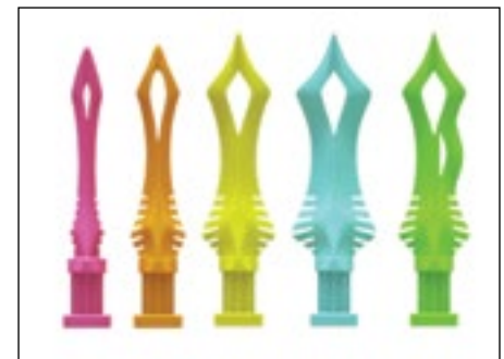
Figure 3. Top view of the Diamond Wedges S, M, L, XL, and DC/F (deep caries/fluting) (patent and patent pending). The diamond cutout allows it to pass through the narrow part of the embrasure and then spring open to stay locked in place and apply pressure evenly to avoid line angle overhangs.