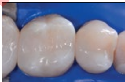
Figure 15. Final postoperative view of monolithic injection molded Class II composite resin (3M Filtek Posterior Bulk Fill, shade A1, regular and flowable resins together) restorations.

tooth-colored fillings are an embarrassment and a disservice. We must and can do better!