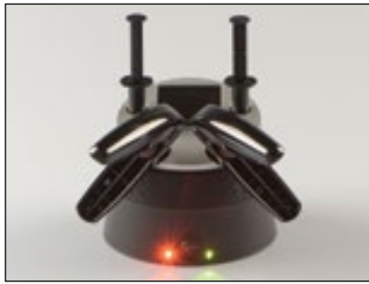
Figure 6. Bioclear HeatSync composite heater (as shown, allows injection molding with less voids and better marginal seal than cold composites). Both the flowable and the regular paste composite are heated to 155°F.

The patient presented with Class II resin composite restorations placed previously by another dentist. The restorations were already chipped, broken, leaking, and undergoing recurrent decay. The patient reported that the marginal ridges began chipping soon after placement, resulting in food impaction. Tragically, they were placed only 4 years previously. Realistically, one must consider how many times a tooth can be restored and re-restored. With people living longer these days, these temporary