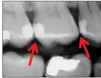
Figure 7. Pre-op bite-wing of the featured case showing chipped marginal ridge resultant from a sharp occlusal embrasure (left arrow) left by a traditional metal sectional matrix and the result of a burnished matrix and (right arrow) a slightly open contact.