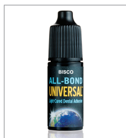
ALL-BOND UNIVERSAL™ Light-Cured Dental Adhesive