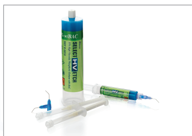
SELECT HV™ ETCH 35% Phosphoric Acid Etchant with Benzalkonium Chloride