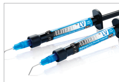
AELITEFLO™ LV Radiopaque Low Viscosity Composite