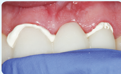
5. Line the INSPIRE provisional with CLING 2 Temporary Cement and seat on the prepared teeth within the 30 second working time. After 60 to 90 seconds, the excess cement is ready to be removed.