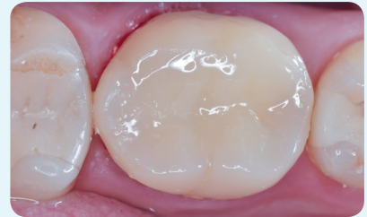
11. The result is a strong, durable, esthetic INSPIRE provisional crown.