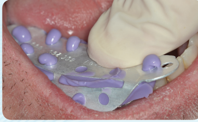
2. Once seated, intraoral set time is approximately 30-45 seconds.