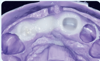
4. The use of INSPIRE Esthetic Provisional Composite in combination with the TEMPLATE matrix results in a strong provisional restoration with minimal flash for ease of finishing.