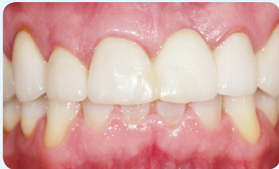
1. Pre-op photo of an existing, unesthetic, anterior bridge to be replaced.