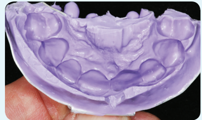
3. After only 30 seconds, remove the tray from the mouth. The result is an accurate and detailed matrix.