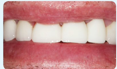
6. The completed anterior INSPIRE provisional restoration: strong, durable and esthetic.