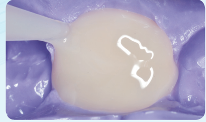
3. Express a small amount of INSPIRE Provisional Composite through the syringe tip onto a mixing pad. Load INSPIRE into the TEMPLATE matrix, keeping the tip submersed. INSPIRE has a 40 second working time.