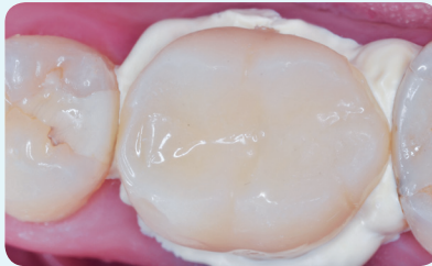
9. Express CLING 2 Temporary Cement directly into the provisional crown. Seat the provisional crown within the 30 second working time. After a 60 to 90 second setting time, remove excess CLING 2 from the preparation margins.