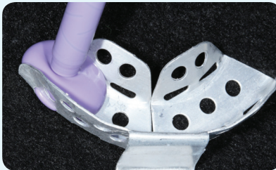
2. Load the customized Anterior TEMPTRAY with TEMPLATE Matrix Material and place intraorally within the 30 second working time.