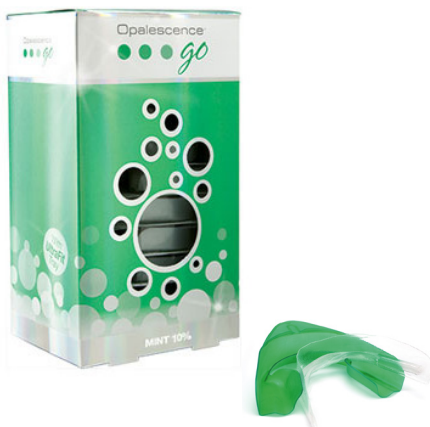
Figure 5: The Opalescence Go patient kit

those who wish to create their own unique product promotions for their dental practices. Customised packaging of whitening products featuring practice names, logos and colours can be produced. ■