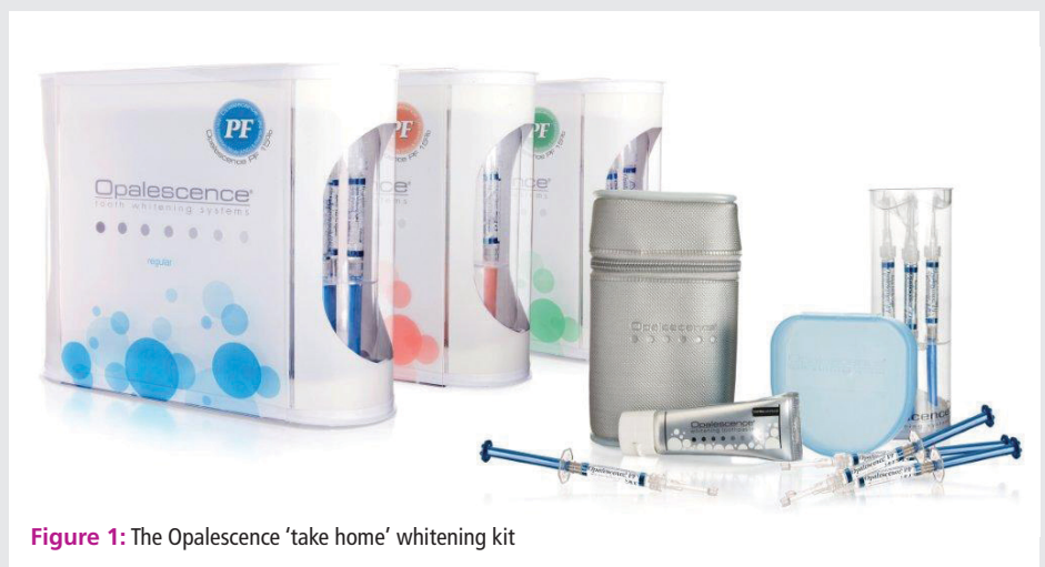
Figure 1: The Opalescence 'take home' whitening kit

In introducing Opalescence to the dental market, Ultradent's aim was to produce a safe and effective product that would protect teeth from dehydration and also increase shade stability. For these reasons, the product takes the form of an aqueous-based gel that is available in two different levels of carbamide peroxide (10 and 16%), with its formulation incorporating potassium fluoride.