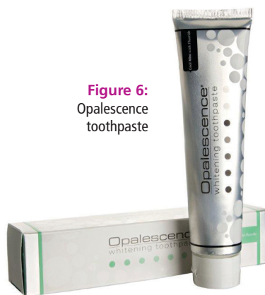
Figure 6: Opalescence toothpaste