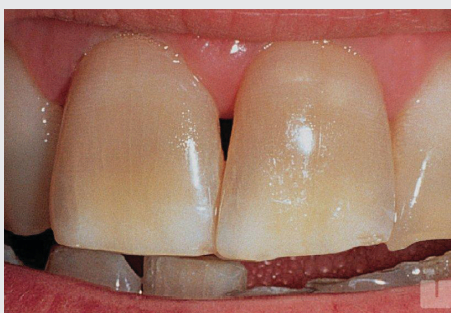
Figure 2a: Tetracycline stained teeth before whitening with Opalescence

Opalescence Go is 6% hydrogen peroxide gel, and comes in a convenient and ready to wear tray, that the patient can easily insert and should then suck down to bring into contact with their teeth. The outer layer of the tray is then removed, leaving an inner tray in situ, which should be left in place for approximately 60 minutes each day, with noticeable results