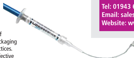
Figure 7: Opalescence gel exhibits viscosity