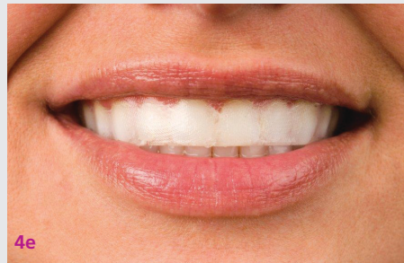
Figures 4a-4e: The ready to use Tres White system. The tray is easily placed, and the outer tray layer is removed, leaving the inner tray in place