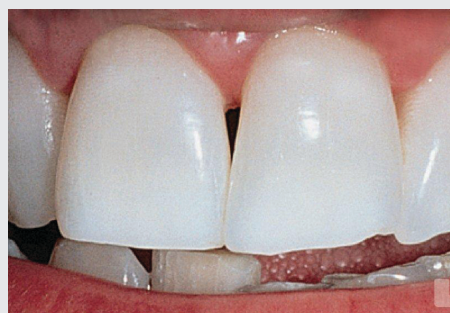
Figure 2b: The same case after whitening with Opalescence