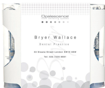
Figure 8: Examples of Optident's bespoke packaging for various private practices. These can be highly effective marketing aids