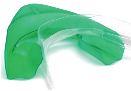
Figure 4: Treswhite Supreme 6% HP is an instant treatment requiring no impressions worn daily for just 30-60 minutes