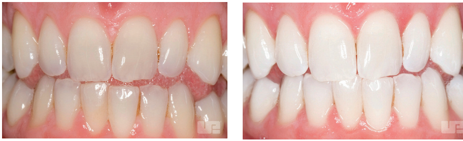
Figures 2-3: Opalescence gives excellent and predictable results

within the patient's expectations, needs and budget.