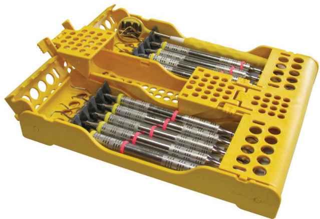
E-Z' Jett 10 place instrument tray in yellow