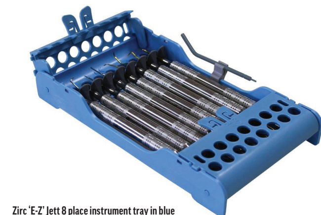
Zirc 'E-Z' Jett 8 place instrument tray in blue

Zirc is an American dental manufacturer that have produced a complete range of products specifically designed to suit the requirements of virtually all dental operator procedures where hand and endodontic