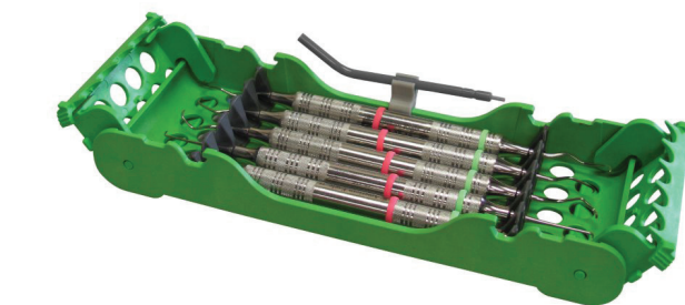
Zirc 'E-Z' Jett 5 place instrument cassette in green

Zirc products are produced with a 'built - in' anti - microbial agent known as 'Microban'. It provides an extra level of protection against the growth of odour and stain causing bacteria and mould. The 'Microban' technology works by